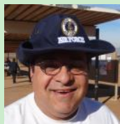
Chino - 7th.